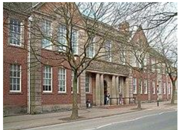
The former technical college, Stoke, now part of Staffordshire University.